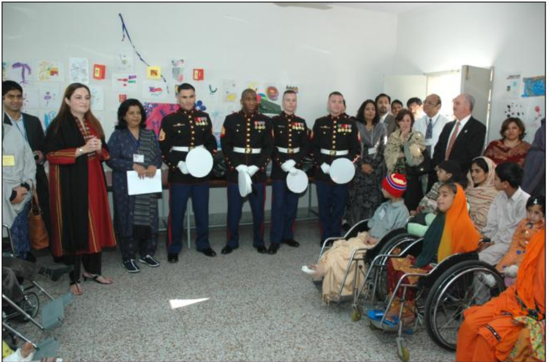
The U.S. Marine Detachment in Islamabad, with the support of the U.S. Embassy in Pakistan, distributed toys to children injured by the October 8 Earthquake. The donation is part of the Marine's annual "Toys for Tots" campaign. The children are being treated at the Rehabilitation Center at the National Institute for Special Education in Islamabad, which is being run by the Women's Aid Trust and Children's Resource International (CRI).