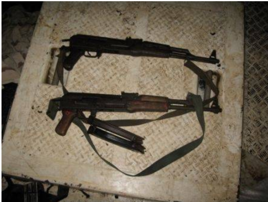
Two Kalashnikov-type assault rifles