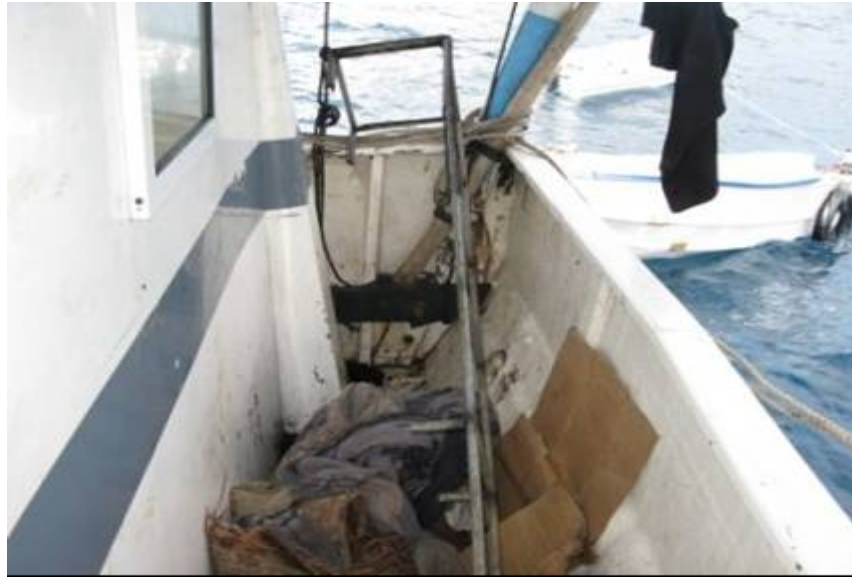
Thin steel ladder with metal arc welded on top, used by pirates to board vessels.