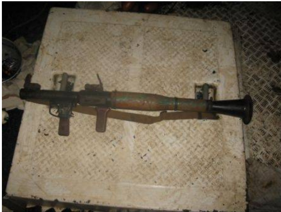
Rocket propelled grenade launcher, type RPG-7