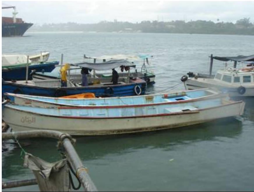
Two skiffs (Arabian model) used by pirates to carry provisions and fuel