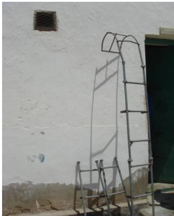
Thin, detachable steel ladder with metal arc welded on top at district CID Headquarters, Berbera.