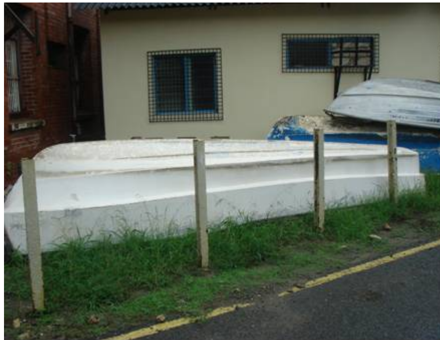
White attack skiff used by pirates to attack a maritime vessel