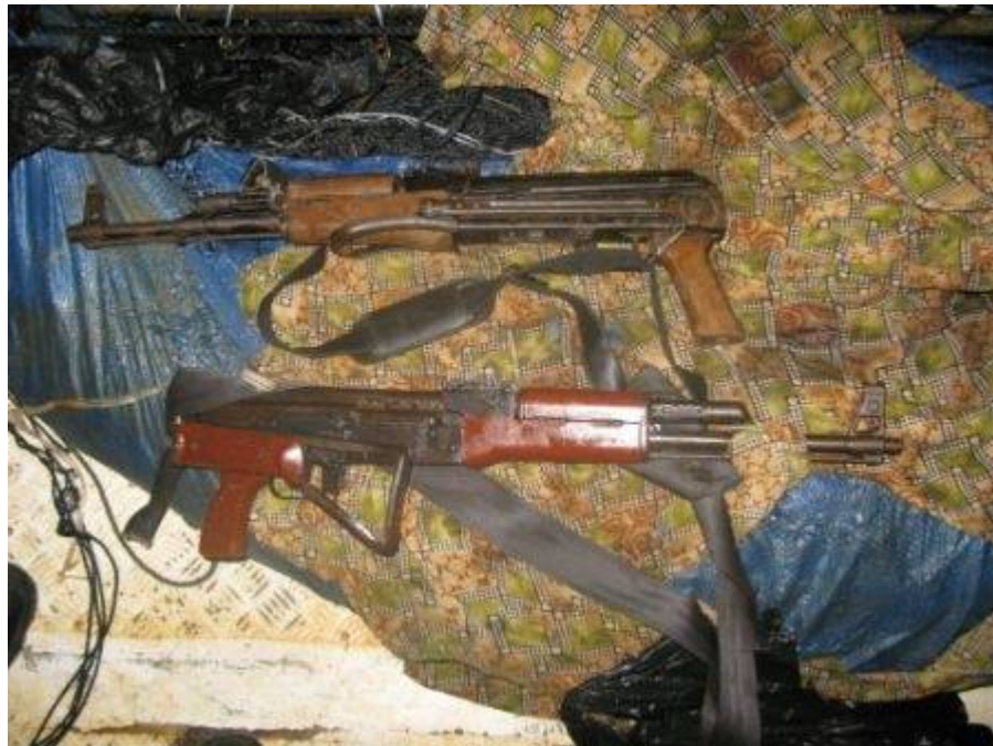
Two Kalashnikov-type assault rifles