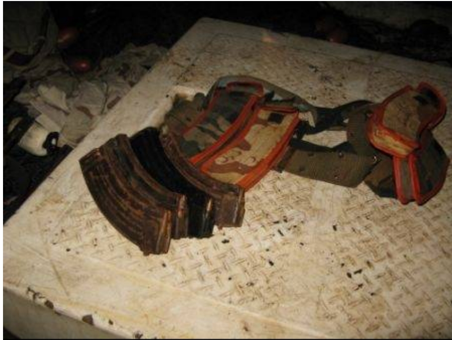
Shoulder holster and chargers