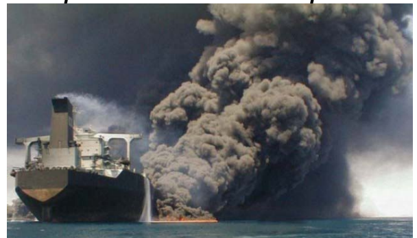
The French supertanker Limburg following an Al-Qaida terrorist attack with an explosives-laden dinghy off the coast of Yemen in October 2002

“...The negative publicity as a result of attacks against oil wells is significant, and is in fact one of the most significant types of damage inflicted upon us by such operations. This is because it brings about the misinformation of many people, while making them justify the tyrants. This makes some people trustworthy and even accepting of the tyrants, may Allah forbid it. Therefore the conclusion is that: at this time, the costs of targeting oil wells in Muslim countries outweighs the benefits. This is because of the negative impact on public health and the environment, and because such operations make Muslims forfeit the opportunity to use these oil wells when Allah finally makes the Islamic nation victorious. Moreover, the apostate governments use such operations to tarnish the image of the jihad and the mujahideen. Finally, such operations drive people away from the truth and from answering the call of al-Tawheed.”