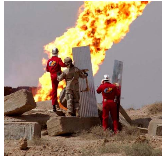
A burning oil well in southern Iraq, March 2003

d. As for what Muslims stand to lose by operations against oil wells... Such operations impact commerce and market conditions in the country. They are also detrimental to the environment and to public health. Moreover, attacking the oil wells also means forfeiting the opportunity to use them again once the Muslim nation reassumes ownership over them—unless, of course, a lot of money is invested in repairing them. This is precisely what the commander of the army of Islam (may Allah make it victorious) Usama Bin Laden said in his statement titled, “The declaration of war against the American occupiers of the Arabian Peninsula’ when he discussed the question of attacking oil wells. He [Bin Laden] said, ‘Fighting in these areas increases the risk of petroleum catching fire, and therefore, we should restrain ourselves, and urge our mujahideen brothers to spare these riches and keep them out of the battle, as they are a priceless Islamic resource, and an important source of economic power for the future Islamic state to be established, Allah willing.’ Nonetheless, we must take into account the date in which this statement was made. [Bin Laden’s] statement was made before the fiery eruption of the jihad and before many developments pertaining to the conflict took place. Since this statement was initially made, attacks against oil-related interests, such as the attack on the French oil tanker, have been claimed by Al-Qaida...”