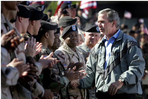
President George W. Bush shakes hands with troops after making remarks on the War on Terror before some 25,000 service members in April at Fort Hood in Killeen, Texas.

Iraq remains a key front in the global war on terror. US, Coalition, and Iraqi forces are engaging international terrorists as part of the security mission mandated by UNSCR 1546 and 1637 in support of the democratically-elected Iraqi government.