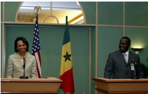
Secretary Rice and Senegalese Foreign Minister Cheikh Tidiane Gadio during a joint press conference at the U.S.-Sub Saharan Africa Trade and Economic Cooperation Forum (AGOA) in Dakar in July.

The Government of Senegal's law enforcement and intelligence entities responded appropriately to all perceived terrorism threats, and shared information with U.S. counterparts. Senegal's continued support of the global war on terror has furthered Senegal's reputation as an example of political and religious moderation in the Muslim world.