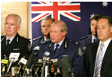
Australian police officials speak at a press conference in Sydney in November after foiling what they described as a "large-scale terrorist attack" in Sydney and Melbourne. Officers arrested more than a dozen suspected terrorists.

Australia launched substantial initiatives and worked with its regional neighbors to assist in building their resolve and capacity to confront terrorism. In November, Australian police arrested 18 suspected terrorists in Sydney and Melbourne, disrupting a potential terrorist attack on Australian soil. Australia enacted comprehensive counterterrorism legislation in December, enhancing the ability of law enforcement and intelligence agencies to detect, detain, and prosecute suspected terrorists. The legislation featured new regimes for "preventative detention" of persons to prevent an imminent terrorist act as well as preserve evidence of a terrorist attack, and "control orders" that would allow the close monitoring of persons believed