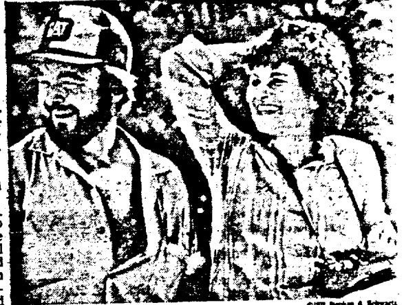
SUCCESSFUL SEERS Ingo Swann and Hella Hammid at Catalina Island during the experiment.

"It was amazing. He directed us to one object after another. The predictions were astonishingly accurate. There were shackles and pulleys and shafts. There were lots of cables and chain and it was remarkably easy to identify the artifacts from the drawings. It was incredible that we ac-