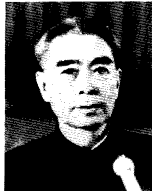
The Ailing Chou En-lai

Once Mao's favorite, his present status is not clear.