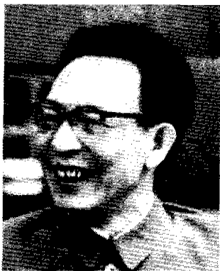
The Left-leaning Chang Chun-chiao He checks and balances Teng Hsiao-ping.

He devotes his limited energy to matters of high policy.