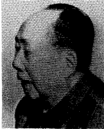
The Aging Mao Tse-tung

His health and policies failing, he presides over the end of an era.