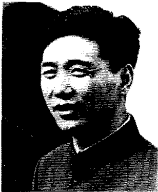
The Youthful Wang Hung-wen

His health and policies failing, he presides over the end of an era.