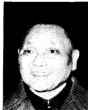
The Right-leaning Teng Hsiao-ping He manages day-to-day affairs.