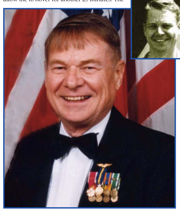
Retired Rear Admiral Don Eaton - Now and Then

five minutes I reduced power to 2700 r.p.m. to allow me to hover for another 25 minutes. The