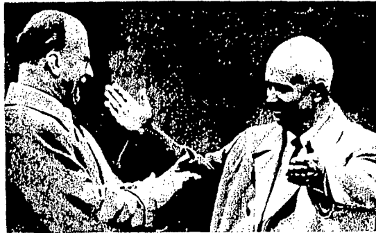
ULBRICHT AND KHRUSHCHEV

To the visible displeasure and astonishment of most of his audience at East Berlin, Khrushchev in his speech there on 20 May counseled patience and forbearance on a separate treaty. Asserting the bloc's "moral right" to proceed without delay, he nevertheless held out hope