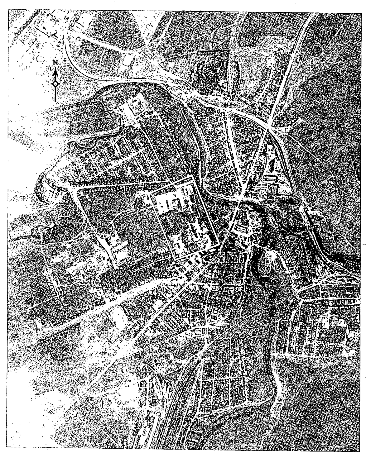
FIGURE 2. PLAVSK ARMY BARRACKS, PLAVSK, USSR, SEPTEMBER 1964.