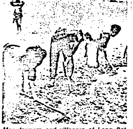
Meo farmers and villagers of Long Pot village preparing the fields for poppy planting in the autumn of 1971

During their 1970 offensive. North Vietnamese and Pathet Lao troops jumped off from the Plain of Jars, drove across the Meo "refugee" areas, and by March were on the heights overlooking Sam Thong. As the attacks gained momentum, Meo living west of the plain fled south, and eventually more than 100,000 were relocated in a 40-mile-wide strip of territory between Long Cheng and the Vientiane Plain. When the Pathet Lao and the North Vietnamese attacked Long Cheng