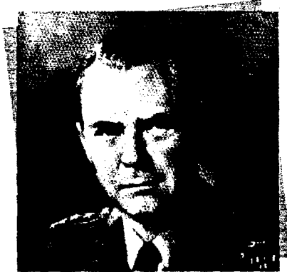
LIEUTENANT GENERAL HOYT S. VANDENBERG, USA 10 JUNE 1946-1 MAY 1947