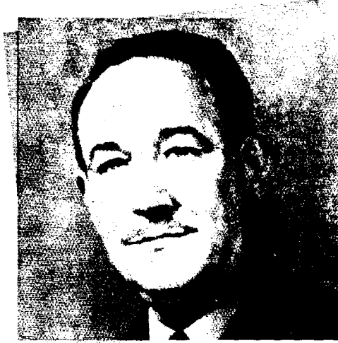
REAR ADMIRAL SIDNEY W. SOUERS, USNR 23 JANUARY 1946-10 JUNE 1946