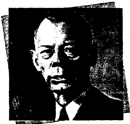
GENERAL WALTER BEDELL SMITH, USA 7 OCTOBER 1950-9 FEBRUARY 1953