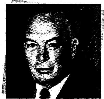
REAR ADMIRAL ROSCOE H. HILLENKOETTER, USN 1 MAY 1947-7 OCTOBER 1950