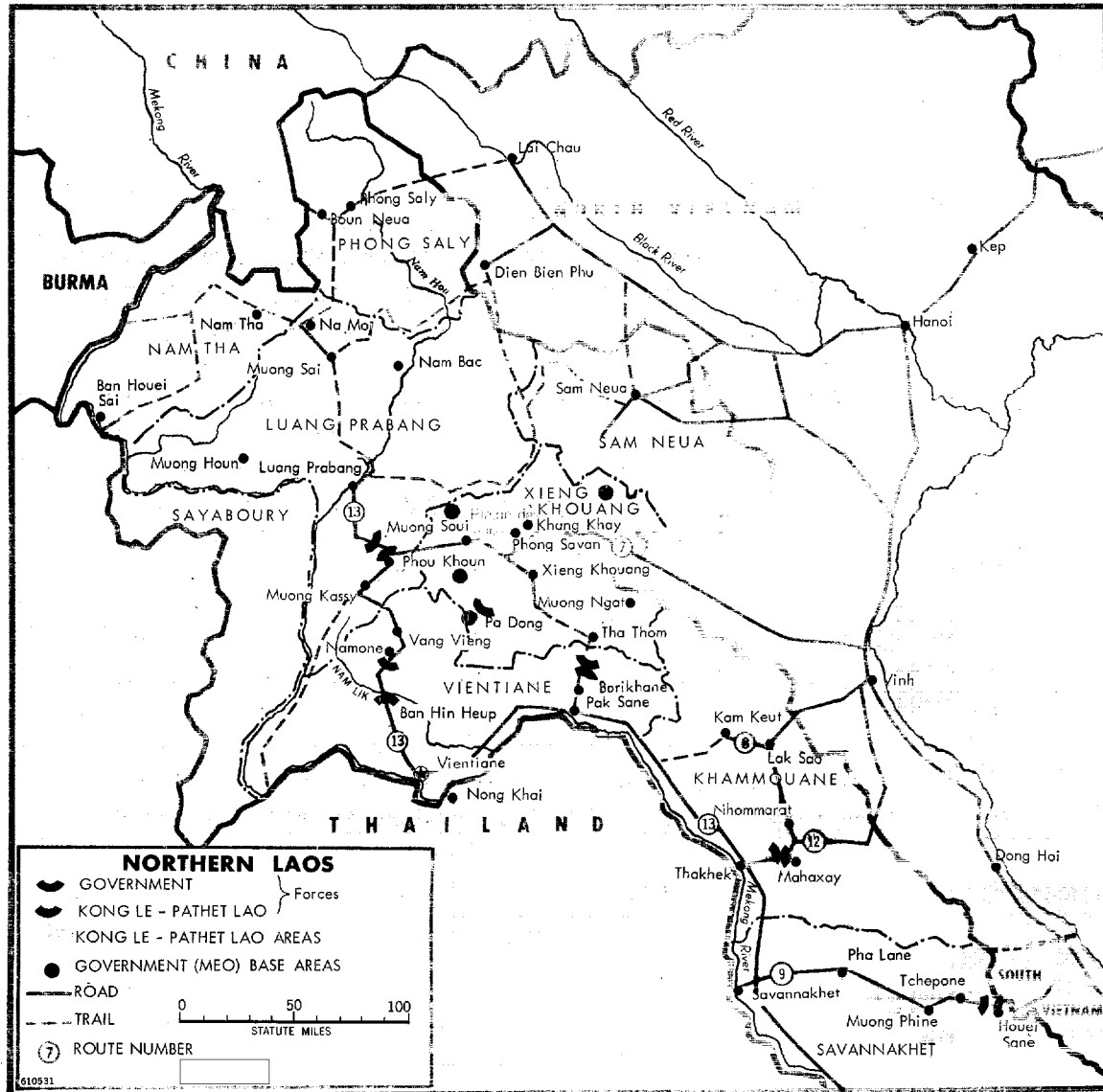
6 June 61 CENTRAL INTELLIGENCE BULLETIN Map Page