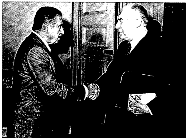
Figure 1. President Pinochet With Interior Minister Jarpa. Fashioning an orderly transition to civilian rule? [Redacted]

The purpose of this paper is to describe the emerging party system and assess its probable development over the next three to five years. We focus on how the nature of the return to democratic government will affect internal party development and relations between parties. The structure of the party system that is fashioned during the twilight of the Pinochet era will, in turn, provide the key indicator of Chile's prospects for political stability under civilian rule. [Redacted]