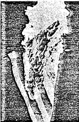
American flag burning in Tehran

Still, the state of anti-American agitation around the world