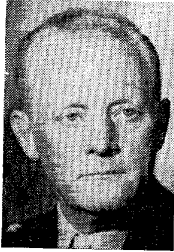
Maj. Gen. Burress

General Burress thereafter served successively as Acting Commanding General, XXI Corps, 1 to 21 Sept. 1945; Com-