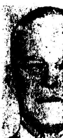
ALLEN DULLES; CROSS COUNTRY

far from the truth, afraid to carry out its orders from Washington.