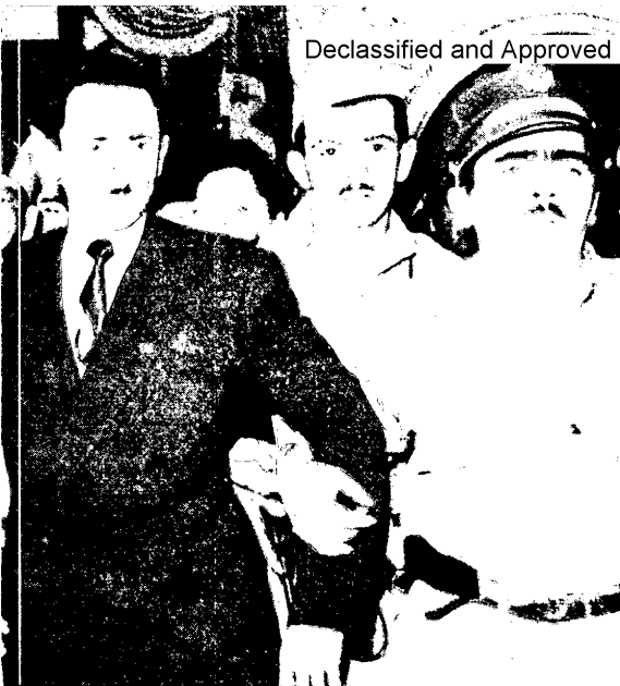
Col. Castillo Armas (left), whose American-armed "freedom forces" drove out Guatemala's Reds.