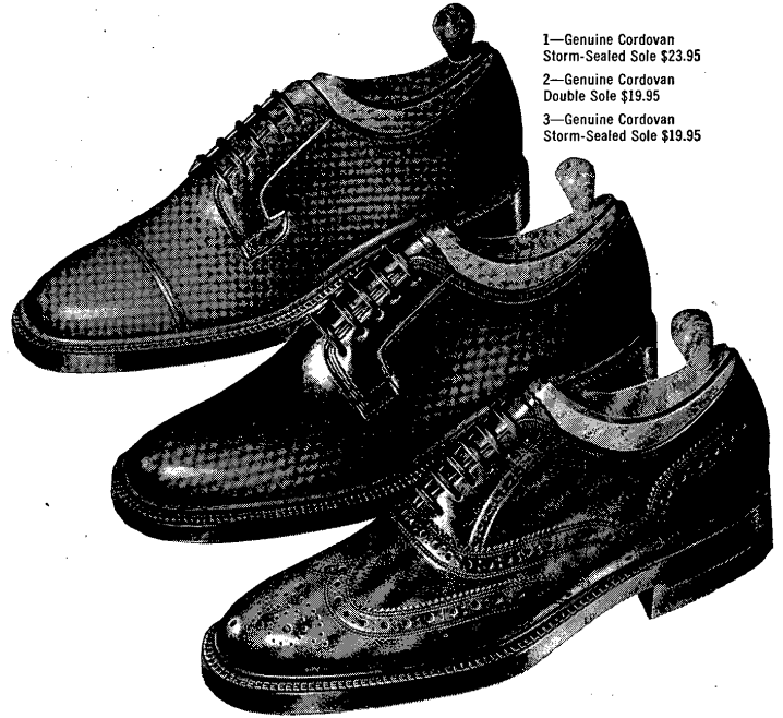
1—Genuine Cordovan Storm-Sealed Sole $23.95 2—Genuine Cordovan Double Sole $19.95 3—Genuine Cordovan Storm-Sealed Sole $19.95

This is the first of three articles on the CIA. Next week, this exclusive report reveals the truth about communist efforts to infiltrate the agency. —The Editors.