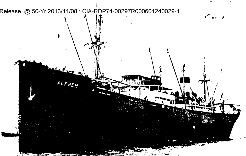
The Swedish freighter Alfhem , which delivered 1900 tons of Czech munitions to Red-dominated Guatemala five months ago. When CIA agents reported the shipment, U.S. guns were flown to Colonel Armas.

and his pretty Nordic-type blond "secretary" were plants of the United States' supersecret Central Intelligence Agency. The innocent-appearing address on the letter was, in reality, a CIA drop in Paris.