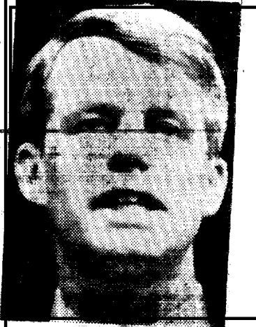
Robert F. Kennedy