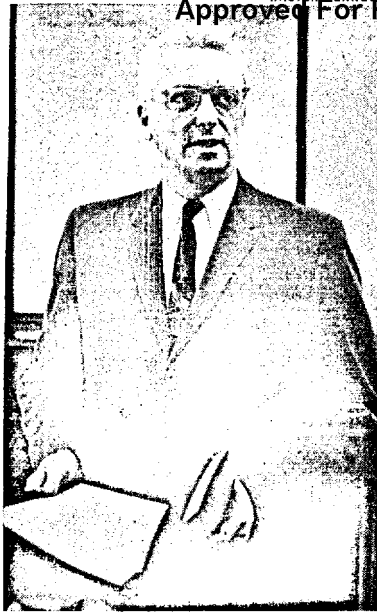
TOP RECRUITER MACY The 25,000 are computerized.