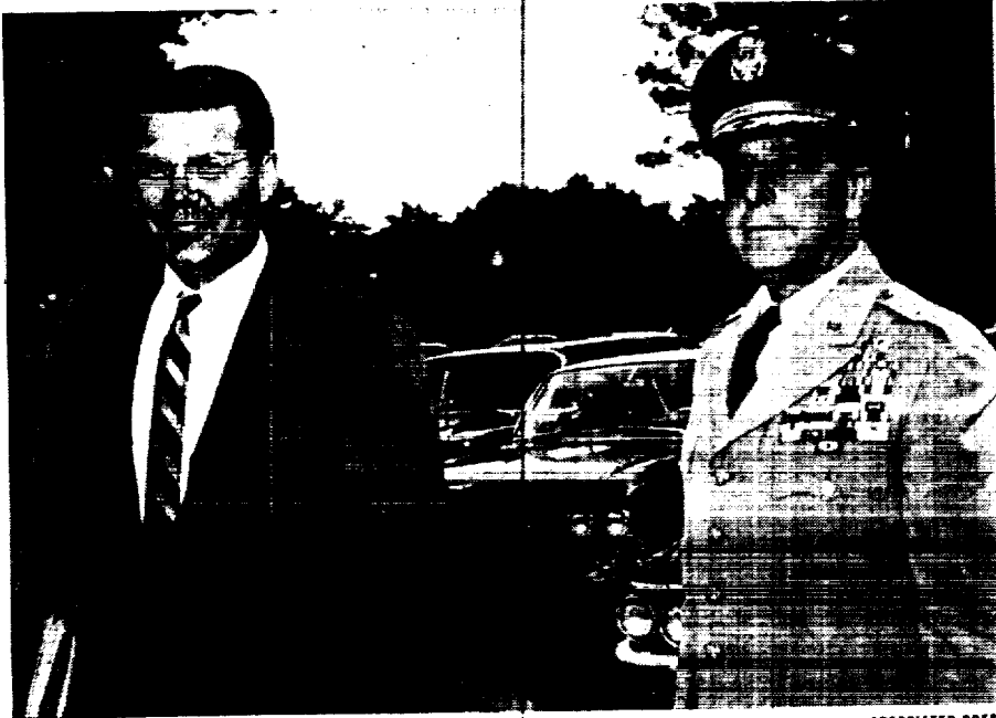
DEFENSE SECRETARY McNAMARA & GENERAL LEMNITZER Accommodation found; confidence lost.

Then, in April, John Kennedy made the great blunder of his Administration: he sent the ill-prepared, anti-Castro rebels into the Bay of Pigs. What was more, Kennedy made the military mistake of withholding air support from the rebels.