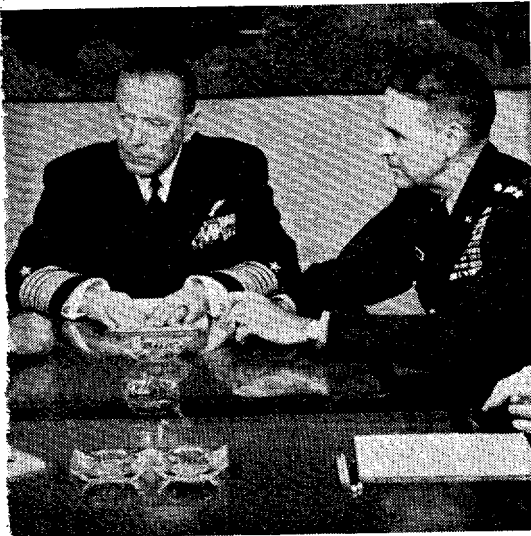
TAYLOR & BENNETT Ever partisan.

Click-Click. On the night of June 6, 1944, Major General Taylor became general to invade Europe when he led his 101st Airborne