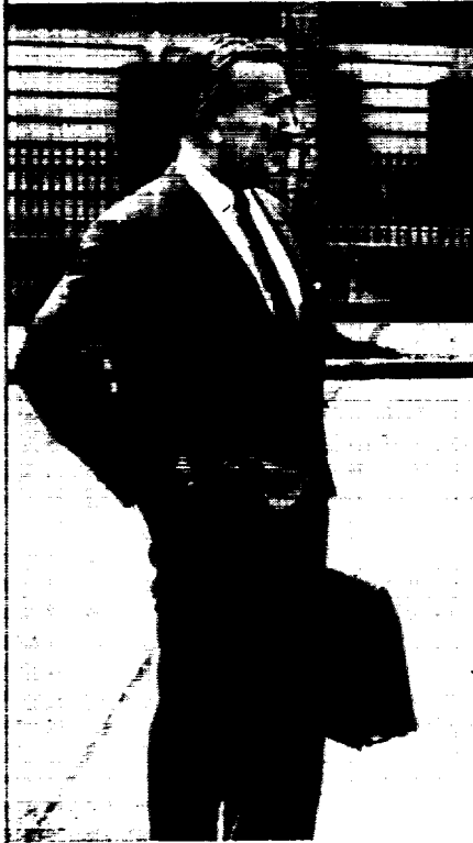
UNDER SECRETARY OF STATE BOWLES The man who came to lunch.

Bowles really did get the point when friends reminded him of two news stories by the President's good friends Columnist Joe Alsop and the Chattanooga Times's Charlie Bartlett, which detailed Bowles's difficulties. The stories, plus the lunch, could only mean he was being fired. As soon as he got sore, Bowles proved to be no pushover. With familiar Madison Avenue skill, he and his pals leaked a spate of stories on the sinister plot to send him