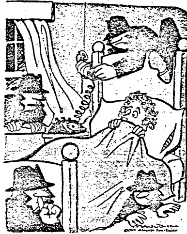
*LADY, THE CIA HAS TO STAY IN PRACTICE BETWEEN FOREIGN ASSIGNMENTS.*

The existence of the agency's domestic operations division has been known at least since 1967, when its establishment (in the early 1960s) was discussed in a book called "The Espionage Establishment" (see page 87 for a new book on the CIA). The continuing