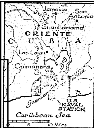
The New York Times