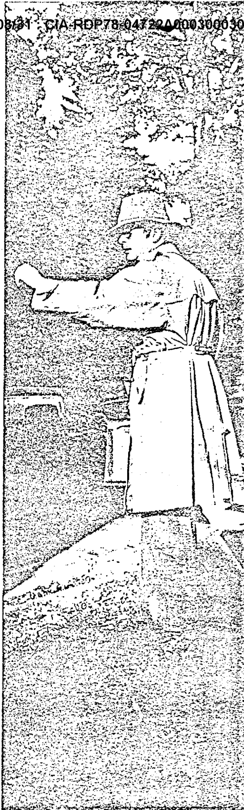
I am a camera

While the State Department has been comparatively honest in accepting the personnel cuts ordered by the Johnson and Nixon administrations, two sources familiar with the CIA budget report that the Agency has done everything possible to escape the reductions. Traditionally, when outsiders—even Presidents—have tried to meddle with the Agency's personnel allotment, the CIA has resisted on "national security" grounds. And