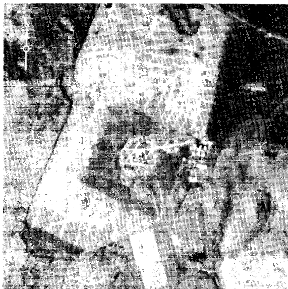
NPIC H-3204 (6/63)

Eleven Category 1 sites have been identified in the USSR (Table 1).