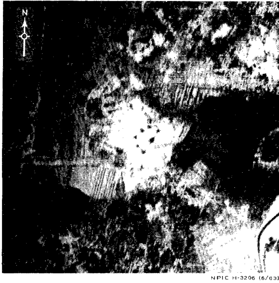
FIGURE 3. EXAMPLE OF CATEGORY 3 SA-0 SAM SITE.