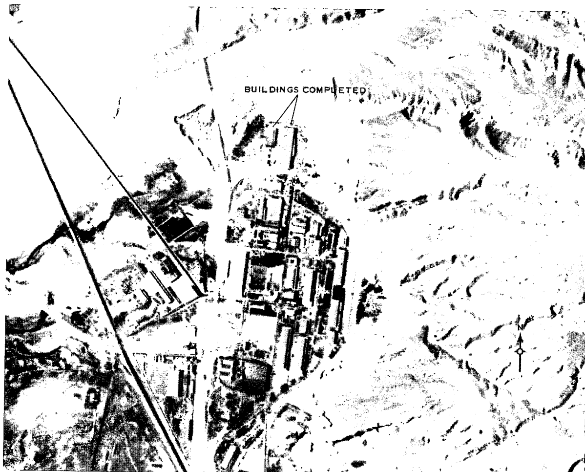
FIGURE 1. MUNITIONS PLANT NO 63, HULWAN, EGYPT [REDACTED]