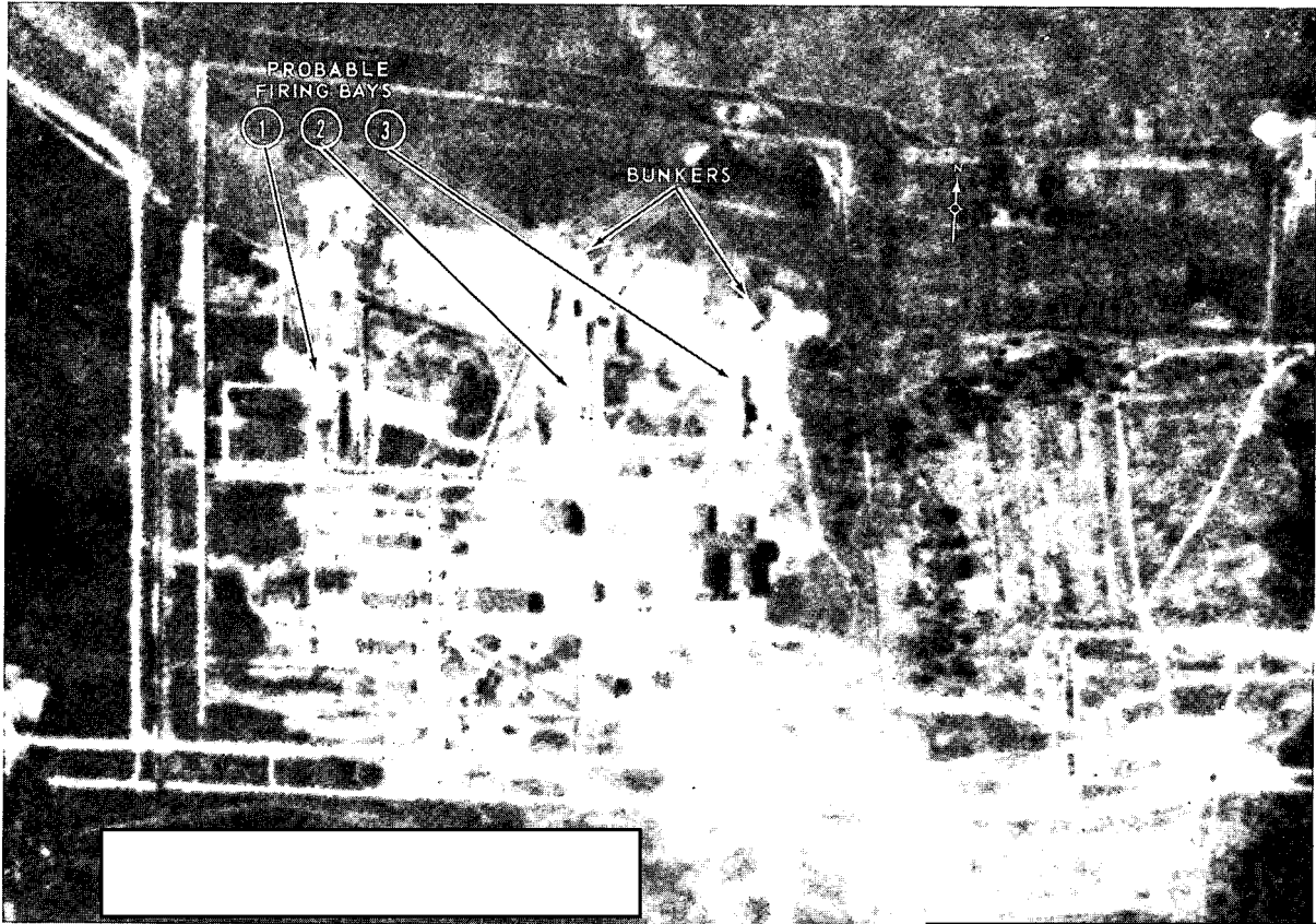
FIGURE 1. PROBABLE STATIC TEST FACILITY AT BIYSK, USSR