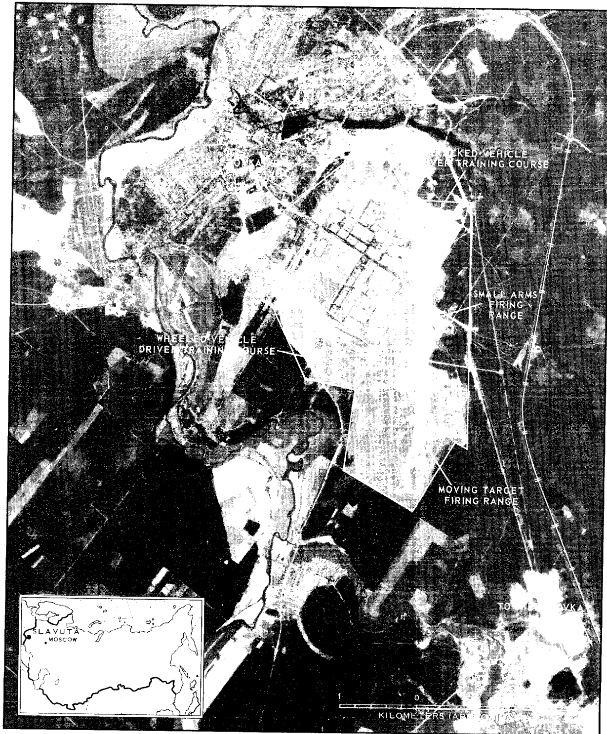
FIGURE 1. MILITARY TRAINING AREA, SLAVUTA, USSR