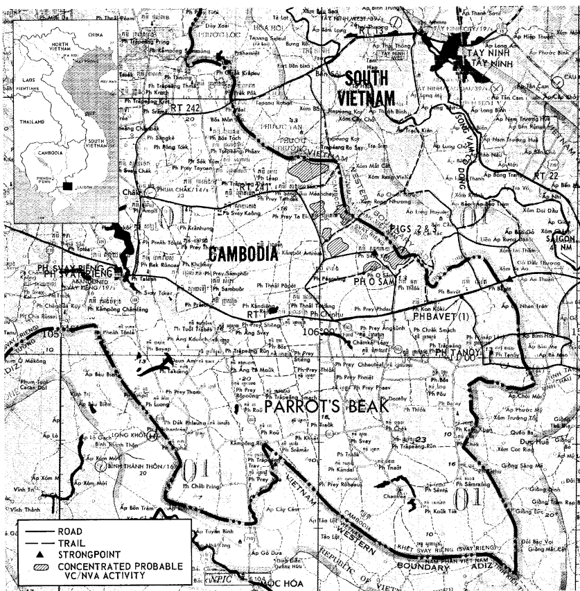
FIGURE 1. LOCATOR MAP WITH TRAILS, ROADS, AND STRONGPOINT.

*NPIC R-138/68, Communist Insurgency Parrot's Beak, Cambodia, December 1968, (CONFIDENTIAL/No Foreign Dissem [redacted]) 25X1C