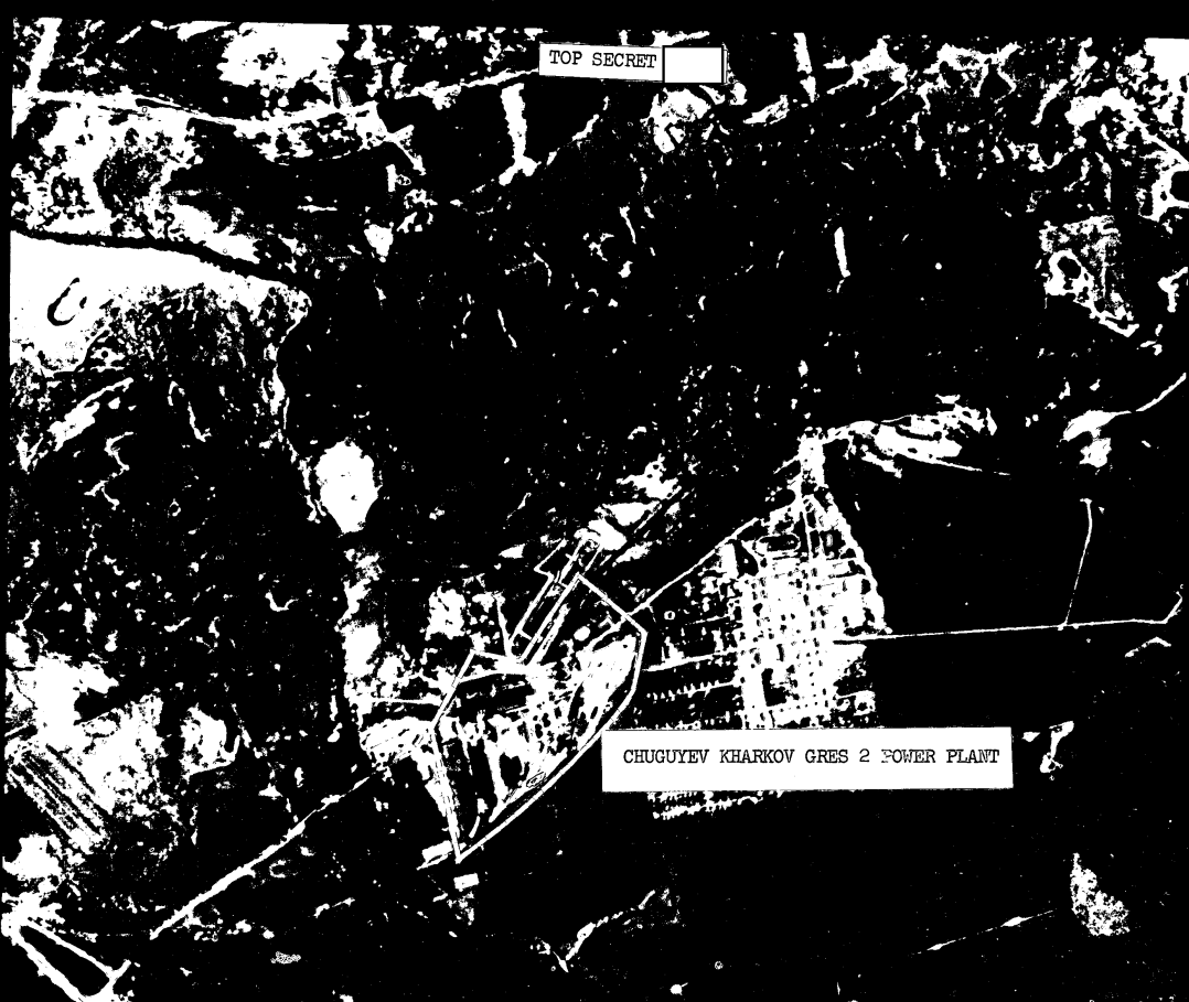
CHUGUYEV KHARKOV GRES 2 POWER PLANT

CHUGUYEV KHARKOV GRES 2 POWER PLANT se 2006/06/26 : CIA-RDP78P04943A00030001002