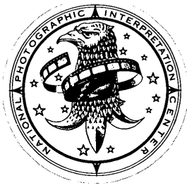
NATIONAL PHOTOGRAPHIC INTERPRETATION CENTER