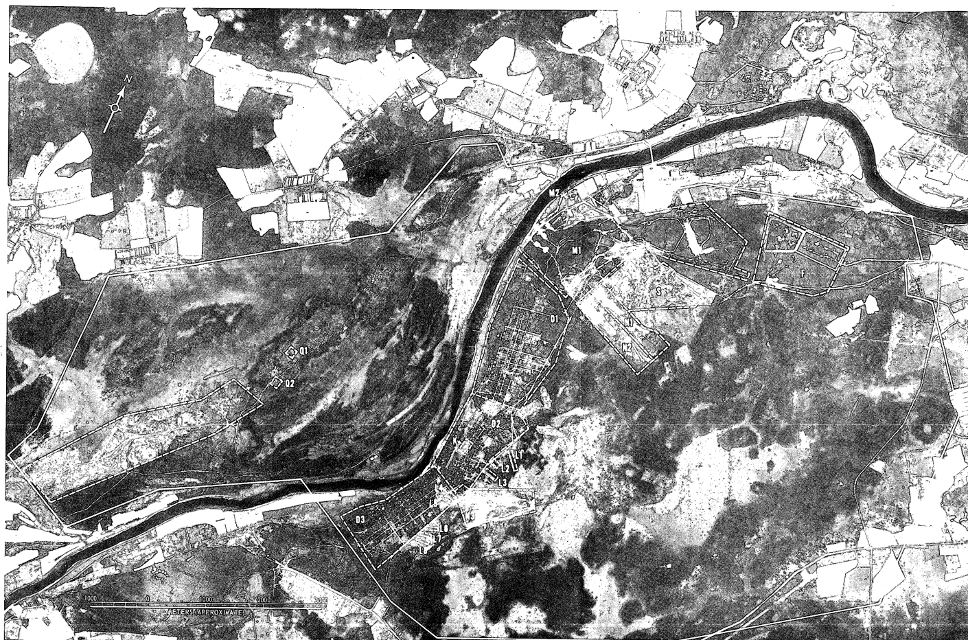
FIGURE 2. KALININ TRAINING AREA CHAPAYEVKA, KALININ, USSR