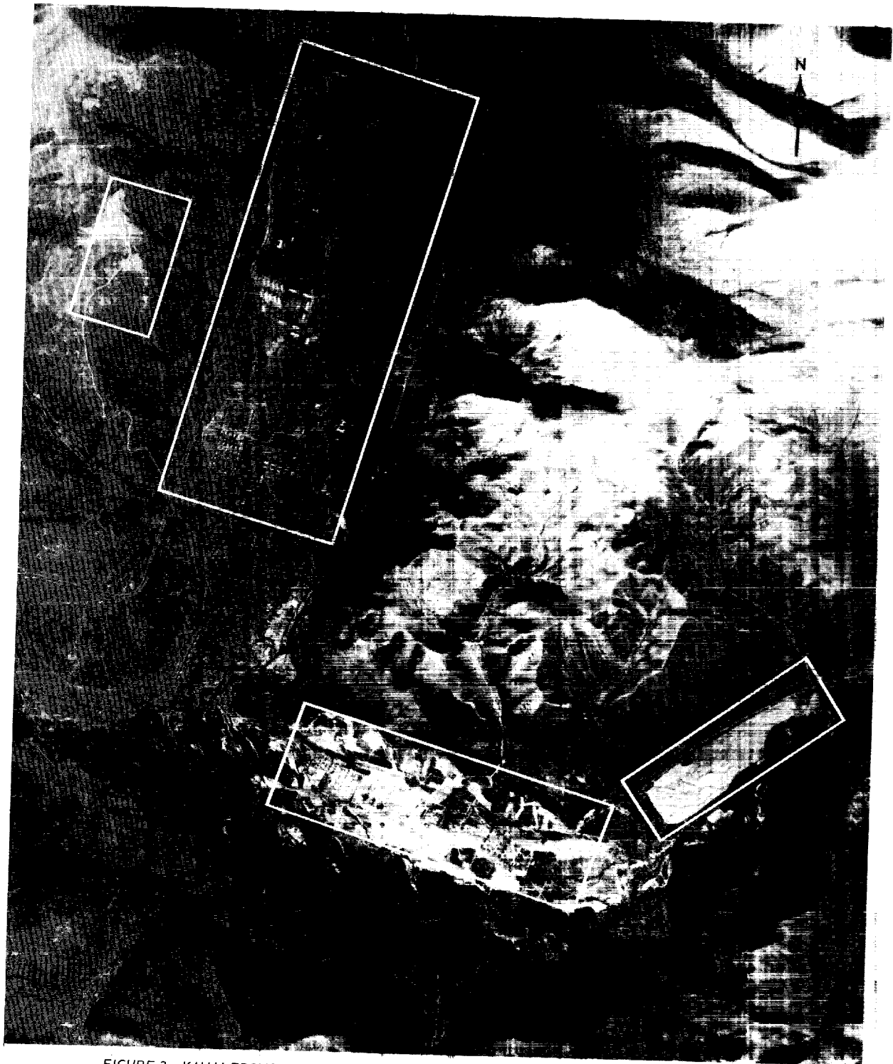
FIGURE 2. KAVALEROVO ARMY BARRACKS KINTSUKHA, KAVALEROVO, USSR, [redacted] 1C K-2972 (8/65)

Approved For Release 2002/06/17 : CIA-RDP78T04759A001600010002-8