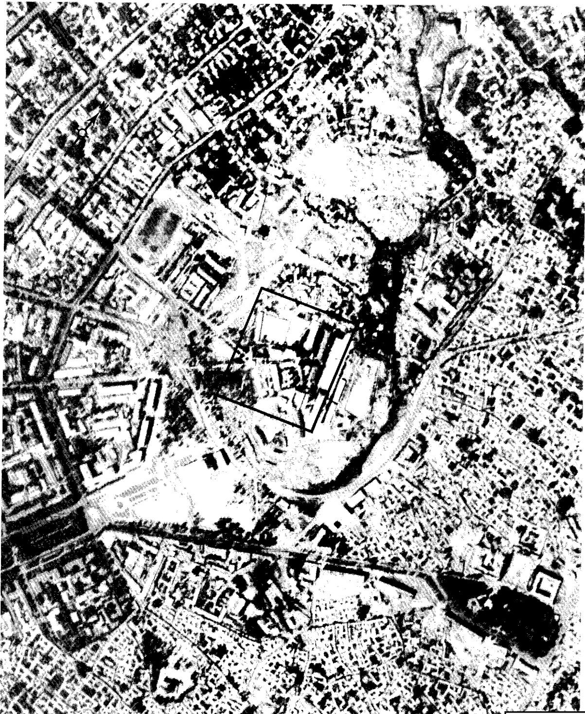
FIGURE 2. SAMARKAND ARMY BARRACKS FORT, SAMARKAND, USSR,

Approved For Release 2009/06/20 : CIA-RDP78T04759A001600010070-3