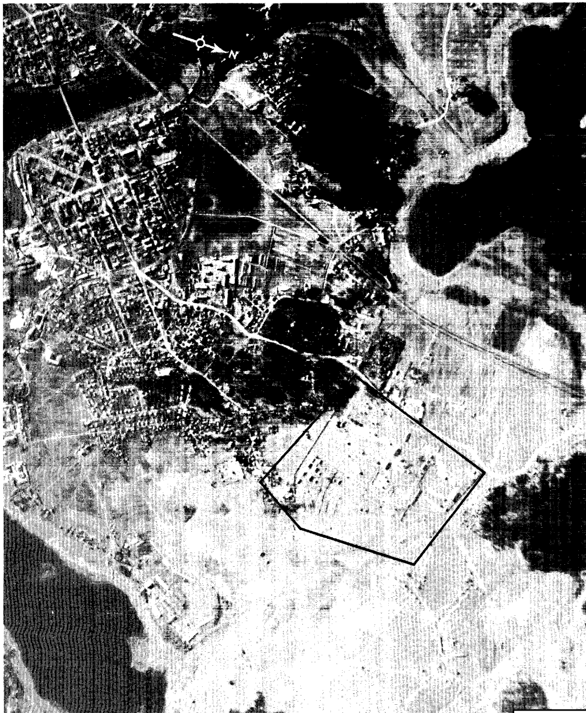
FIGURE 2. SORTAVALA ARMY BARRACKS, SORTAVALA, USSR, [redacted] [redacted]

Approved For Release 2003/06/20 : CIA-RDP78T04759A001800010114-2