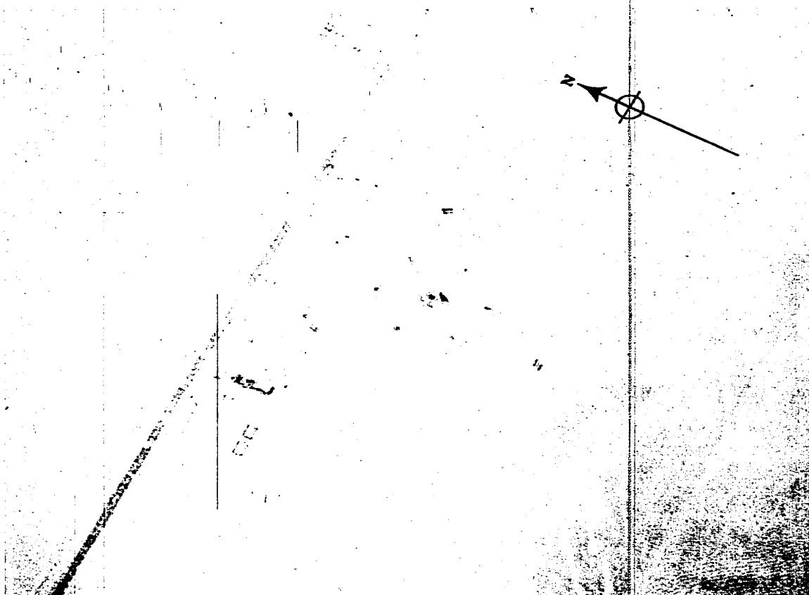
Figure 1. SAM SITE 14 NM SSE OF ZAPOROZHYE.