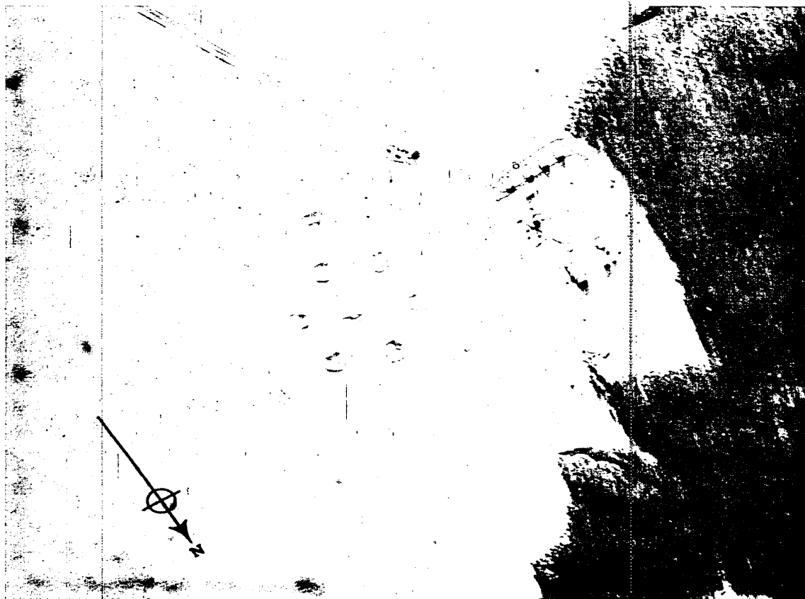
Figure 1. SAM SITE 12.5 NM EAST OF KAZAN.

SUBJECT : Surface-to-Air Missile Site NO : PIC/JB-62/60 LOCATION: 12.5 nm east of Kazan, USSR DATE : 12 April 1960 COORD: 55°49'N 49°27'E