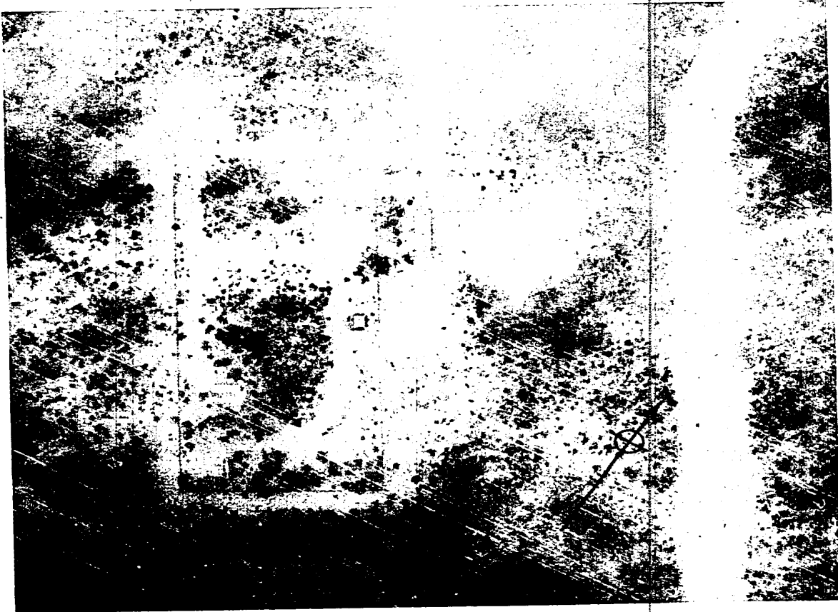
Figure 1. SAM SUPPORT FACILITY 3 NM WEST OF SAROVA.

NO : PIC/JB-66/60 DATE : 14 April 1960 COORD: 54°55'N 43°17'E