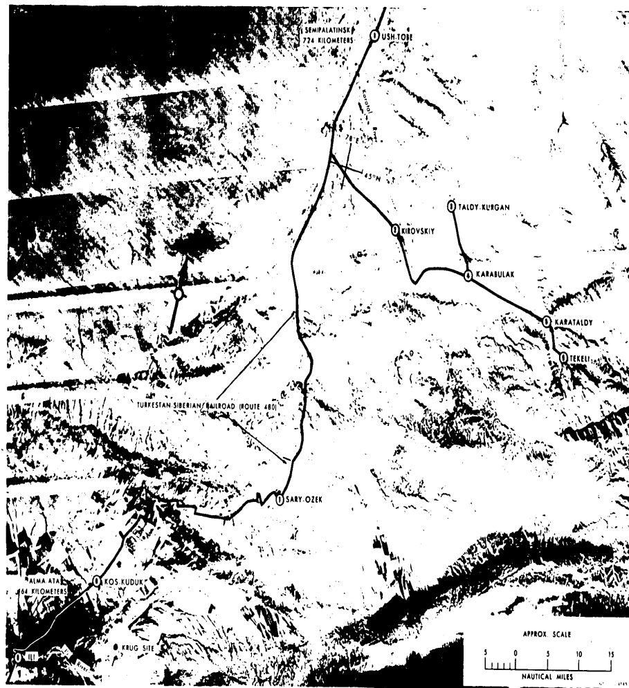
FIGURE 2. USH-TOBE--ILI SECTION OF TURKESTAN-SIBERIAN RAIL ROAD.