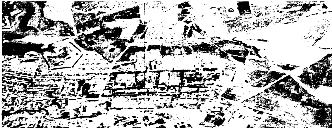
FIGURE 1. LENINAKAN ARMY BARRACKS NORTH, USSR [redacted]

*Buildings of more than one story are designated multistory and floor space is computed on a basis of 2 stories.