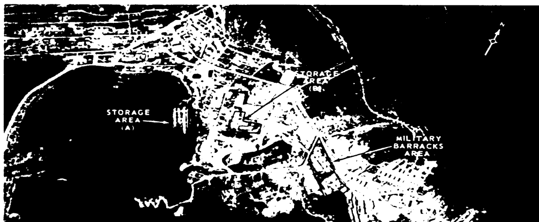
FIGURE 1. MILITARY INSTALLATIONS (AREA 3), PETROPAVLOVSK-KAMCHATSKIY, USSR [REDACTED]

A military barracks area with billeting facilities for 940 troops (based on 50 sq ft of floor space per man) is located 2.8 miles SE of the center of Petropavlovsk-Kamchatskiy at 53-01N 158-42E (UTM 57UVU788759). It covers 18 acres and contains 17 buildings: eleven 95 by 45 ft barracks (47,025 sq ft), one 40 by 320 ft administration building (12,800 sq ft), one 45 by 195 ft administration building (8,775 sq ft) and 4 support buildings from 40 by 110 ft to 15 by 25 ft (6,150 sq ft).