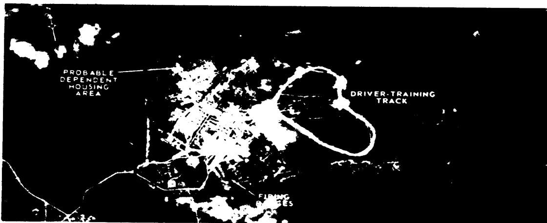
FIGURE 1. MILITARY INSTALLATION (AREA 7), PETROPAVLOVSK-KAMCHATSKIY, USSR

USAF. DDIR. S. 59-4. Petropavlovsk, USSR , Jul 59 (TS)