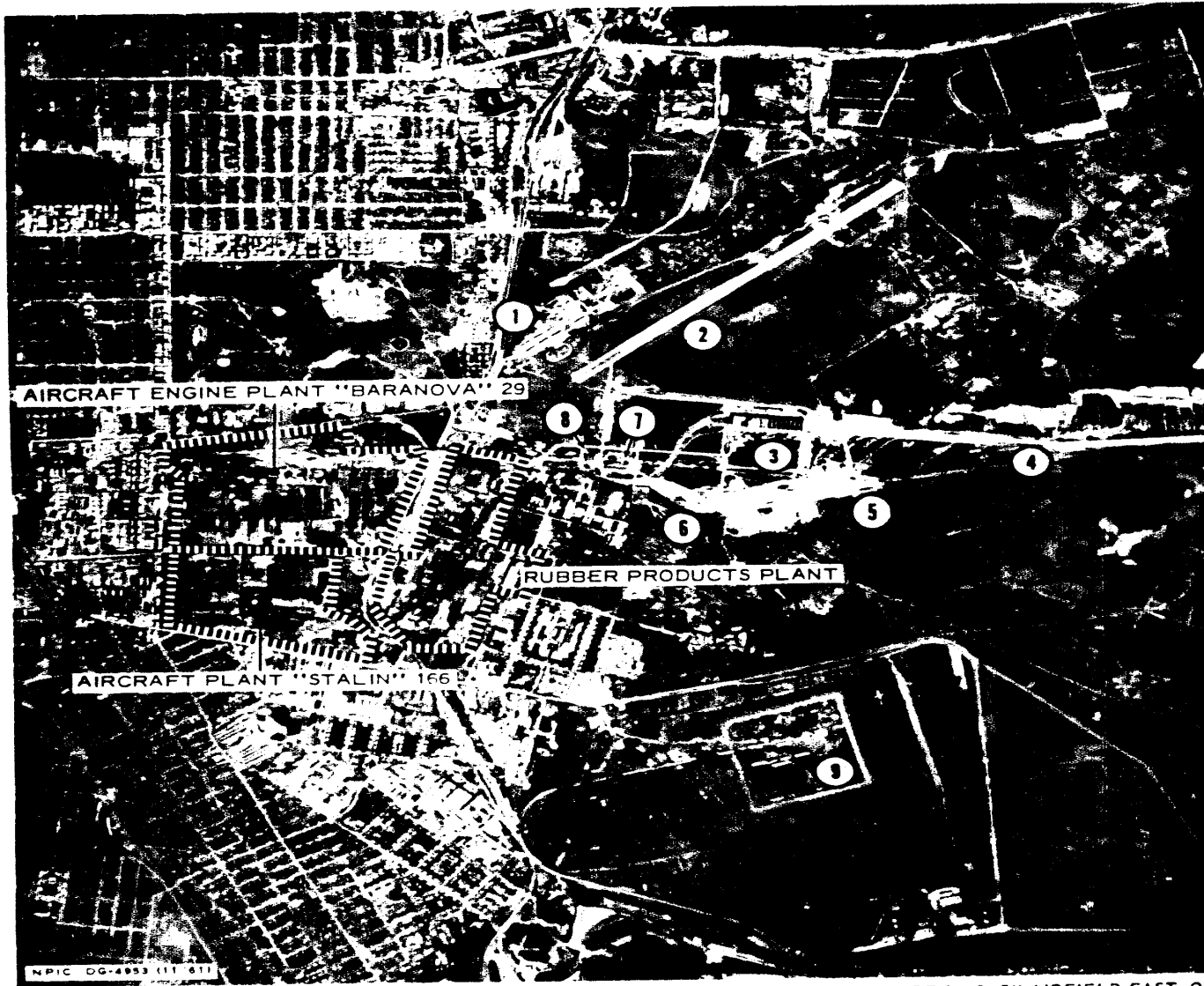
FIGURE 2. OMSK AIRFIELD EAST, O