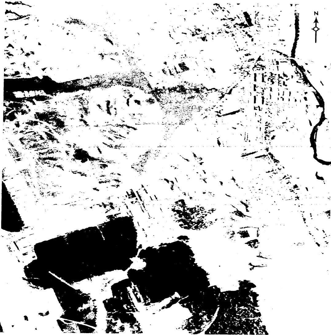
FIGURE 2. SLOINIM ARMY BARRACKS AND HEADQUARTERS 8TH TANK DIVISION, SLOINIM, USSR, [REDACTED]