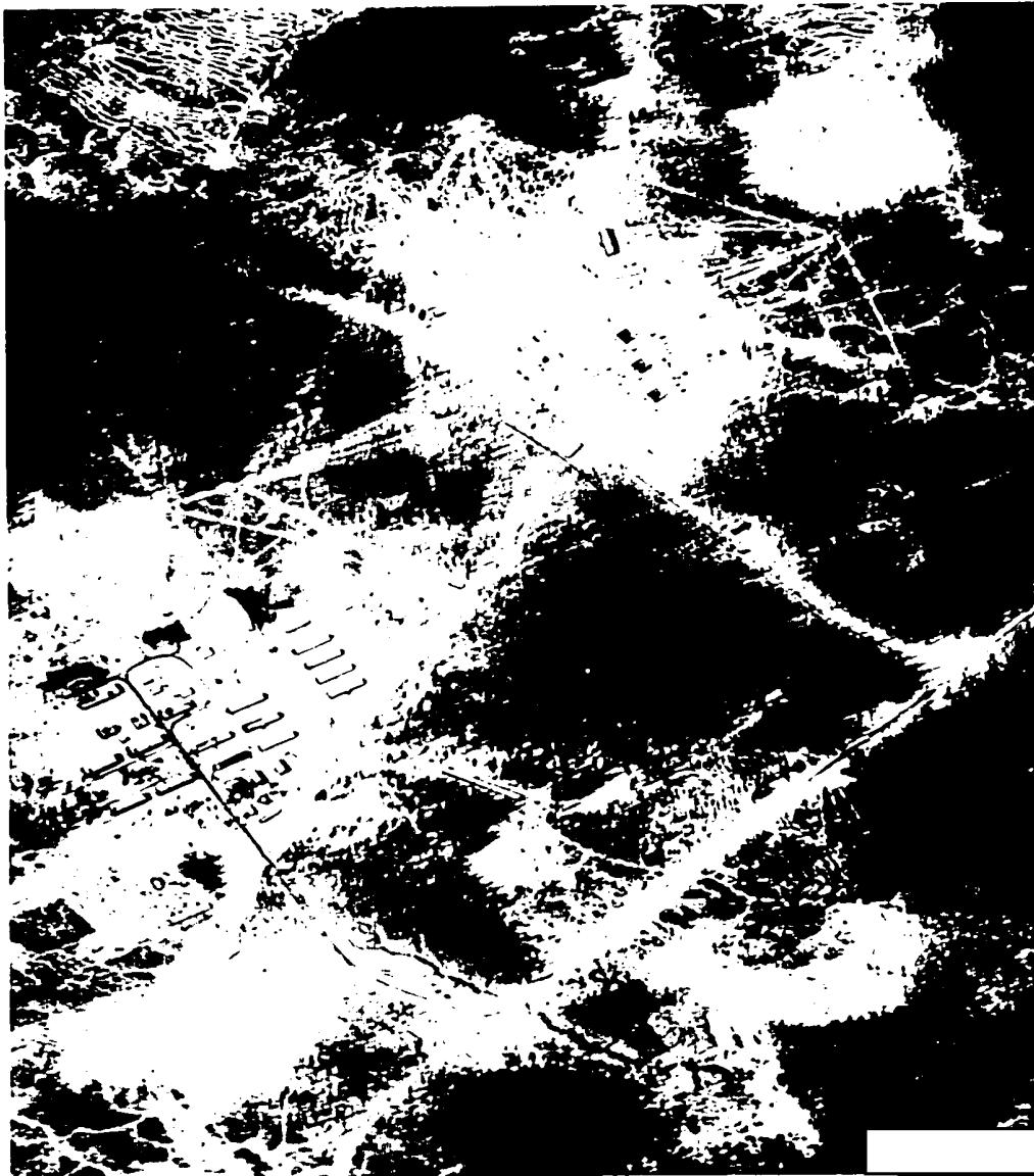
FIGURE 2. LAUNCH AREA F.