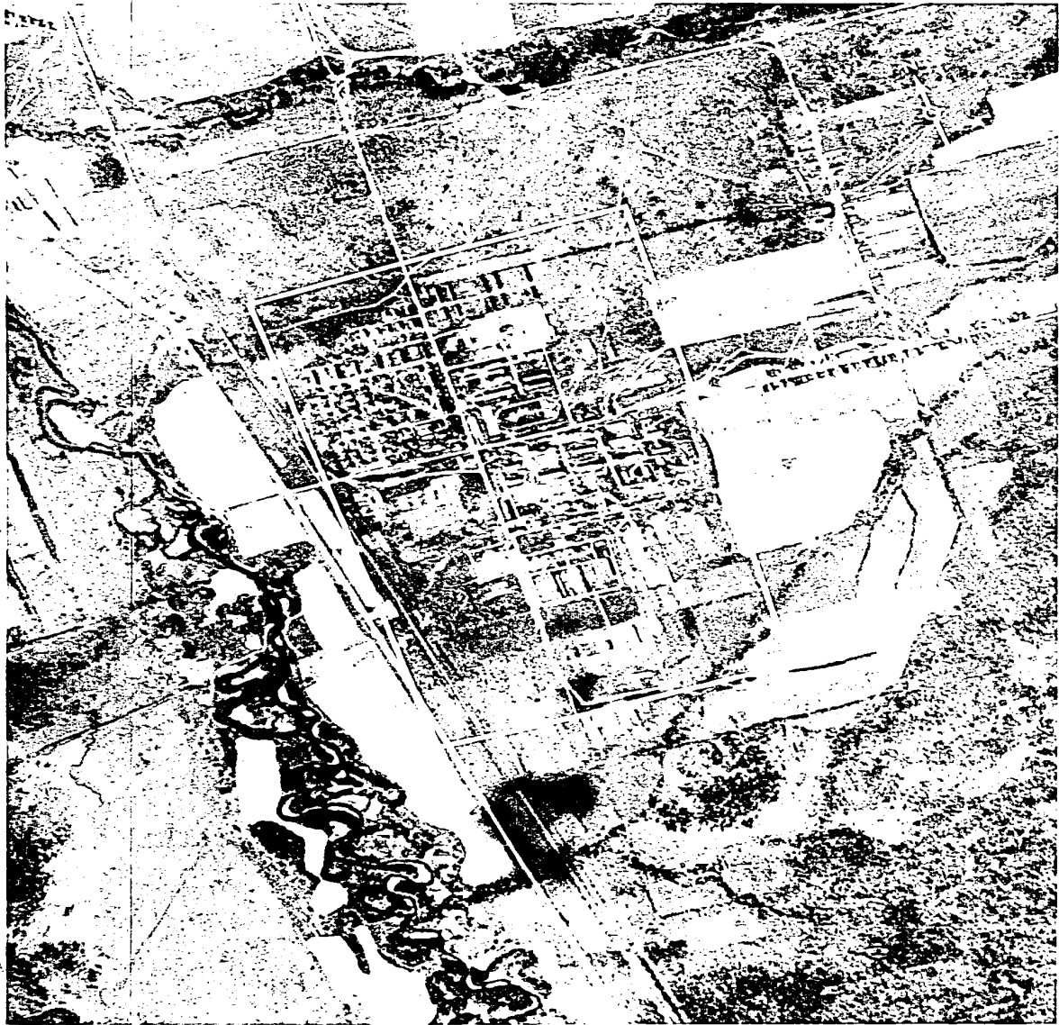
FIGURE 2. DOLINSK ARMY BARRACKS SOKOL YUZHNO GORODOK, DOLINSK, USSR, [REDACTED]