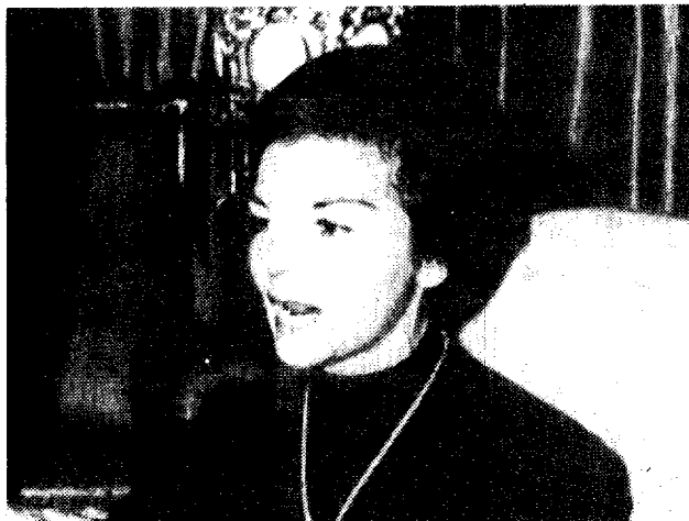
President Peron At first cabinet meeting

99 Behind-the-scene maneuvers may already have begun as ambitious members of Peron's inner circle struggle to improve their positions. Lopez Rega's continued prominence in the power structure is certain to set off even sharper infighting among the Peronists, and it could sour the President's relationships with the military and with party leaders. For the time being, Lopez Rega's adversaries in the government may contain their opposition out of deference to Mrs. Peron and a desire to avoid rocking the boat. As time goes on, however, pressures on Mrs. Peron to get rid of him will intensify.