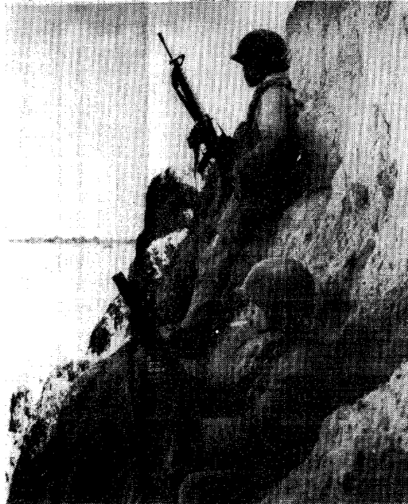
Watch on the Mekong

27 [Meanwhile, Cambodian army units northwest of Phnom Penh have been reinforcing the argument the government has made in its declaration—that a military victory is not possible for the Communists. After three weeks of heavy fighting