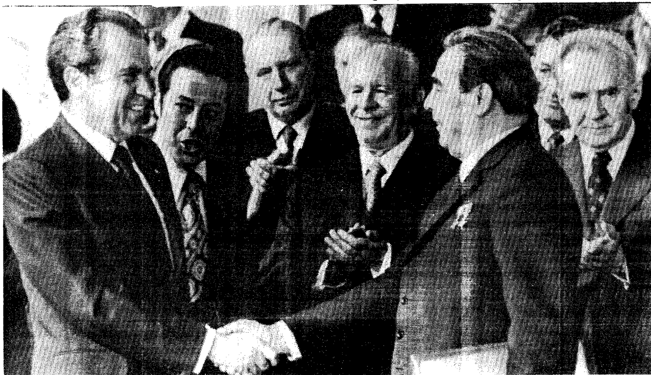
The President with Soviet leaders Podgorny, Brezhnev, and Kosygin