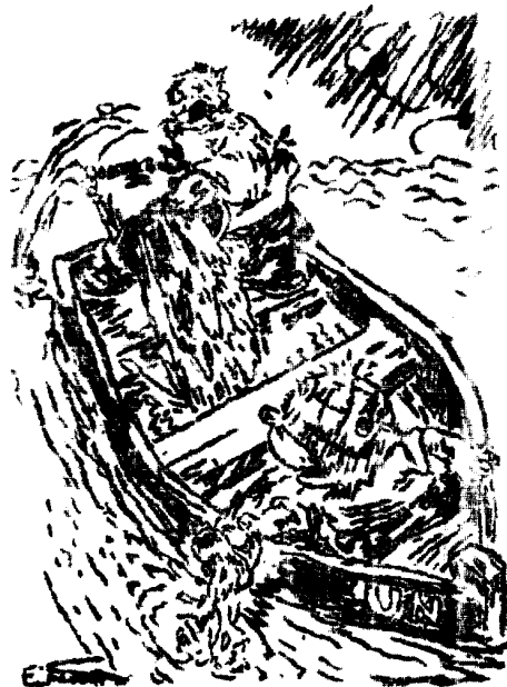
Faster Than We Can Bail It Out

SC action on Indonesia ineffective so far. The Netherlands has so stalled on recent Security Council resolutions as to make them absolutely ineffectual but, unable to drop the case because of Asiatic bloc pressure, a mild SC censuring of the Dutch attitude will probably be forthcoming. Lacking the military means to enforce its decisions and having, in all previous cases, failed to evoke economic sanctions, the Council has been forced to rely solely on moral suasion and the pressure of world opinion to make its orders effective. The Dutch, relying on this, delayed full compliance until their objective was gained and a fait accompli was before the world. Three further courses of action remain open to the SC: (1) it may, in view of its inability to enforce its resolutions, seize upon belated Dutch semi-compliance as a face-saving maneuver and acknowledge Dutch action as evidence of honorable intentions; (2) it may term the Netherlands maneuver an insult to the UN and indulge in mild censure; or (3) it may yet impose sanctions after denouncing the Netherlands as mocking the Council.