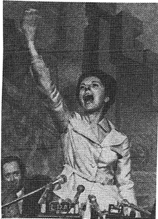
President Peron Addressing Labor Leaders

The meetings were held against a backdrop of rising criticism of Mrs. Peron's leadership and the government's inability to halt the economic decline. There were rumors that a dramatic confrontation would occur with labor bosses and politicians pushing for Lopez Rega's ouster. Some thought the military might join the campaign. Several sources also reported that labor was planning to demand a larger role in policy making.