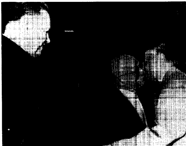
The French Communist’s present aversion to association with the Soviets is a repudiation of their own recent past. In this 1972 photo, B. N. Ponomarev (far right) embraces French Communist leader Jacques Duclos at the opening of an international Communist conference in Paris. The smiling onlooker at the far left is V. V. Zagladin, now the First Deputy Chief of the International Department of the CC/CPSU.

The same Congress witnessed a move to formally drop the French Party’s commitment to the “dictatorship of the proletariat.” This hoary phrase has been symbolic of the French Party’s commitment to a Soviet-style one-party dictatorship. As such, it was clearly out of phase with the PCF’s efforts to sell itself