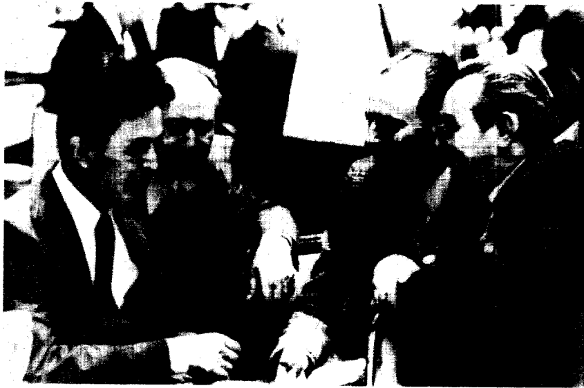
The two faces of the Conference of European Communist Parties. In the top photo, a frowning L. I. Brezhnev and B. N. Ponomarev (the Soviet Party official responsible for relations with nonruling Communist Parties) listen to the speeches of delegates to the Congress. In the bottom photo, Brezhnev and Ponomarev are all smiles as they meet publicly with Enrico Berlinguer, the independently-minded leader of the Italian Communists. (Berlinguer is at the far left.)