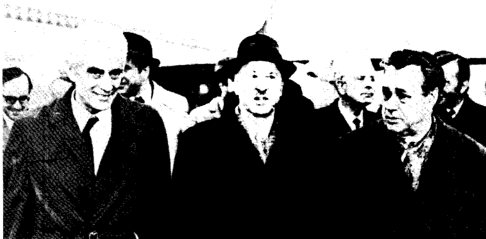
Soviet Party Secretary B. N. Ponomarev (middle) greets Portuguese Party leader Alvaro Cunhal (left) at the latter's arrival in Moscow at the head of a Portuguese government delegation in 1974. Despite the appearance of Ponomarev at the airport, the visit produced an agreement to play down the links between the two Parties.

enemies out of positions of power before they could coalesce against him, and in his unpreparedness to use force against them. This conclusion no doubt inclined Moscow to respond favorably to the PCP, which showed no comparable reluctance in 1974-1975 to take the offensive against its rivals.