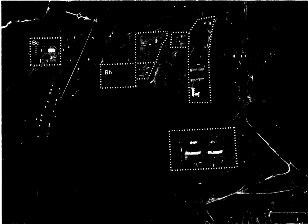
USSURIYSK ARMY BARRACKS SSE AL-1, [redacted] (43-44N 132-00E)